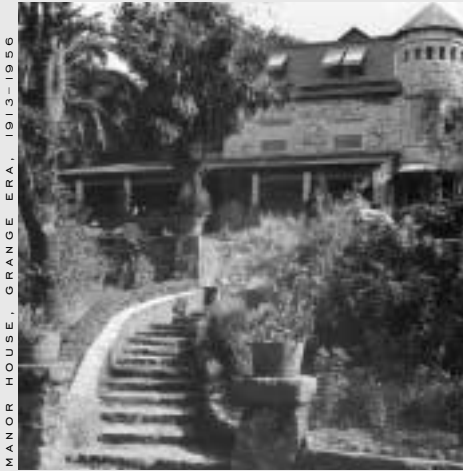
MANOR HOUSE, GRANGE ERA, 1913-1956

The 1993 reserve Petite Syrah was a first effort at pulling together the results of the genetic quest, with first official bottlings under the Ne Cede Malis label in 1997, and the 1998 due out this spring. When the barrels for this wine are being racked, you can back out of the old cellar and all the way over to the Manor House and still smell it, the aromas are so intense.